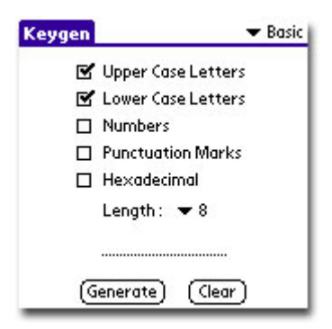
Figure 2 : Basic mode

Keygen offers two modes for generating passwords. These modes, Basic and Custom , are reached with two different forms. At any time, you can switch from one to the other mode just by using the popul list located at the top right of the running form.