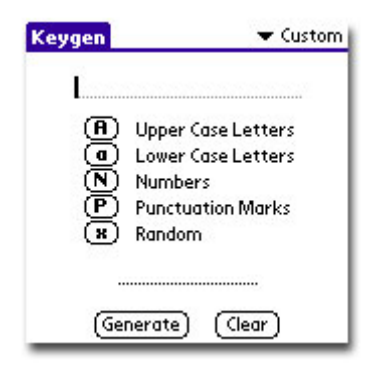
Figure 3: Custom mode

Cut, copy and select operations are allowed on the two forms. The password string is always displayed in the field located at the bottom of the forms.